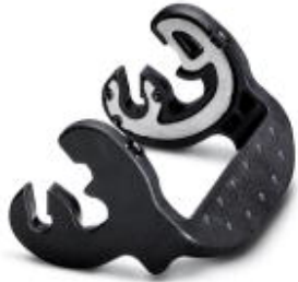
Replacement plastic single locking latch for standard housings of type B6

Please be informed that the data shown in this PDF Document is generated from our Online Catalog. Please find the complete data in the user's documentation. Our General Terms of Use for Downloads are valid ( http://phoenixcontact.com/download )