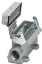
Box mounting base, with single locking latch, height 57 mm, without screw connection, 1x Pg16, with protective covers

Please be informed that the data shown in this PDF Document is generated from our Online Catalog. Please find the complete data in the user's documentation. Our General Terms of Use for Downloads are valid ( http://phoenixcontact.com/download )