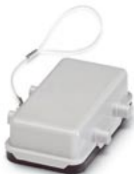
HEAVYCON protective cover, B10 series, for sleeve housing with double locking latch, with retaining cord, IP54, with seal

Please be informed that the data shown in this PDF Document is generated from our Online Catalog. Please find the complete data in the user's documentation. Our General Terms of Use for Downloads are valid ( http://phoenixcontact.com/download )