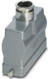
HEAVYCON B24 sleeve housing, for single locking latch, height: 76 mm, with 1 x Pg29 screw connection, straight cable outlet

Please be informed that the data shown in this PDF Document is generated from our Online Catalog. Please find the complete data in the user's documentation. Our General Terms of Use for Downloads are valid ( http://phoenixcontact.com/download )