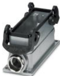
Box mounting base, with double locking latch, height 67 mm, with screw connection, 1x M25

Please be informed that the data shown in this PDF Document is generated from our Online Catalog. Please find the complete data in the user's documentation. Our General Terms of Use for Downloads are valid ( http://phoenixcontact.com/download )