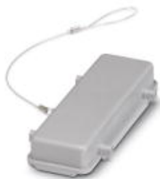
HEAVYCON protective cover, B24 series, for sleeve housing with double locking latch, with retaining cord, IP54, with seal

Please be informed that the data shown in this PDF Document is generated from our Online Catalog. Please find the complete data in the user's documentation. Our General Terms of Use for Downloads are valid ( http://phoenixcontact.com/download )