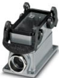
Box mounting base, with double locking latch, height 67 mm, with screw connection, 1x Pg21

Please be informed that the data shown in this PDF Document is generated from our Online Catalog. Please find the complete data in the user's documentation. Our General Terms of Use for Downloads are valid ( http://phoenixcontact.com/download )