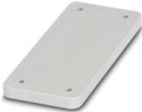
HEAVYCON cover plate, for wall cutouts of type B16, 7 mm thick, gray

Please be informed that the data shown in this PDF Document is generated from our Online Catalog. Please find the complete data in the user's documentation. Our General Terms of Use for Downloads are valid ( http://phoenixcontact.com/download )