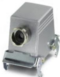
Sleeve housing, with double locking latch, height 76 mm, with screw connection, 1x Pg21, lateral cable entry

Please be informed that the data shown in this PDF Document is generated from our Online Catalog. Please find the complete data in the user's documentation. Our General Terms of Use for Downloads are valid ( http://phoenixcontact.com/download )