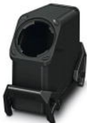
HEAVYCON EVO sleeve housing, plastic, with bayonet flange for EVO screw connection, B24, with double locking latch, height: 87.5 mm, without EVO screw connection

Please be informed that the data shown in this PDF Document is generated from our Online Catalog. Please find the complete data in the user's documentation. Our General Terms of Use for Downloads are valid ( http://phoenixcontact.com/download )