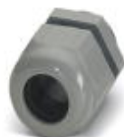
Cable gland, Cable gland material: Polyamide 6, External cable diameter 11 mm ... 17 mm, Shielding: No, Connecting thread: M25, Color: silver grey

Cable gland - G-INS-M25-M68N-PNES-GY - 1411126