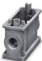
HEAVYCON ADVANCE B16 box mounting base, for M6 screw locking, salt-water-resistant aluminum, with 2 x M25 thread, without surface coating

Please be informed that the data shown in this PDF Document is generated from our Online Catalog. Please find the complete data in the user's documentation. Our General Terms of Use for Downloads are valid ( http://phoenixcontact.com/download )