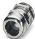
Cable gland, Cable gland material: Brass, nickel-plated, External cable diameter 11 mm ... 17 mm, Shielding: No, Connecting thread: M25, Color: silver

Cable gland - G-INS-M25-M68N-NNES-S - 1411165