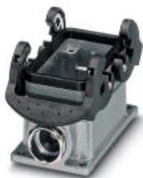
Box mounting base, with double locking latch, height 52 mm, with screw connection, 2x Pg16

Please be informed that the data shown in this PDF Document is generated from our Online Catalog. Please find the complete data in the user's documentation. Our General Terms of Use for Downloads are valid ( http://phoenixcontact.com/download )