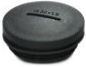
Filler plug, plastic, size: M40