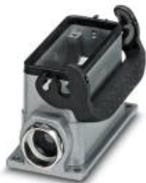
Box mounting base, with single locking latch, height 67 mm, with screw connection, 2x Pg21

Please be informed that the data shown in this PDF Document is generated from our Online Catalog. Please find the complete data in the user's documentation. Our General Terms of Use for Downloads are valid ( http://phoenixcontact.com/download )