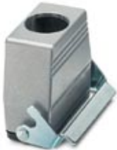
HEAVYCON coupling housing B16, with single locking latch, height 80 mm, without support 1x M40

Please be informed that the data shown in this PDF Document is generated from our Online Catalog. Please find the complete data in the user's documentation. Our General Terms of Use for Downloads are valid ( http://phoenixcontact.com/download )