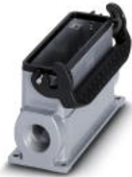
HEAVYCON box mounting base B24, with single locking latch, height 84 mm, with support 1x M32

Please be informed that the data shown in this PDF Document is generated from our Online Catalog. Please find the complete data in the user's documentation. Our General Terms of Use for Downloads are valid ( http://phoenixcontact.com/download )