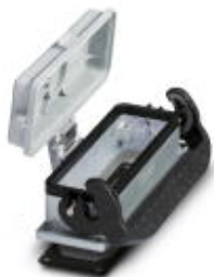
HEAVYCON panel mounting base HV6, with single locking latch, height 27 mm, with cover

Please be informed that the data shown in this PDF Document is generated from our Online Catalog. Please find the complete data in the user's documentation. Our General Terms of Use for Downloads are valid ( http://phoenixcontact.com/download )