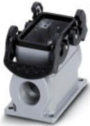
HEAVYCON box mounting base B10, with double locking latch, height 52 mm, with supports 2xM20

Please be informed that the data shown in this PDF Document is generated from our Online Catalog. Please find the complete data in the user's documentation. Our General Terms of Use for Downloads are valid ( http://phoenixcontact.com/download )