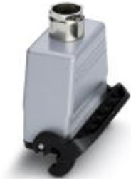
HEAVYCON coupling housing B16, with single locking latch, height 80 mm, with screw connection 1x Pg21

Please be informed that the data shown in this PDF Document is generated from our Online Catalog. Please find the complete data in the user's documentation. Our General Terms of Use for Downloads are valid ( http://phoenixcontact.com/download )