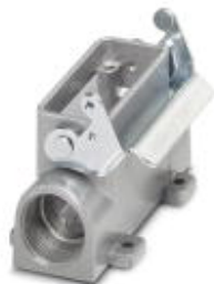
HEAVYCON box mounting base D 15, with single locking latch, height 52 mm, with support 1x M25

Please be informed that the data shown in this PDF Document is generated from our Online Catalog. Please find the complete data in the user's documentation. Our General Terms of Use for Downloads are valid ( http://phoenixcontact.com/download )