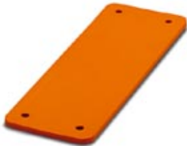
Cover plate, for HEAVYCON wall cutouts, reinforced design, cutout 36 x 65 mm, for type B10

Please be informed that the data shown in this PDF Document is generated from our Online Catalog. Please find the complete data in the user's documentation. Our General Terms of Use for Downloads are valid ( http://phoenixcontact.com/download )