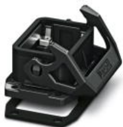
HEAVYCON EVO panel mounting base, plastic, B6, with single locking latch, height: 30.5 mm, with flat gasket

Please be informed that the data shown in this PDF Document is generated from our Online Catalog. Please find the complete data in the user's documentation. Our General Terms of Use for Downloads are valid ( http://phoenixcontact.com/download )