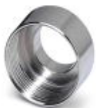
Step-up adapter, M20 to M25, including O-ring

Extension adapter - ENLAR-M-KV-M20/M25 - 1647666