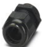
Cable gland, Cable gland material: Polyamide 6, External cable diameter 6 mm ... 12 mm, Shielding: No, Connecting thread: M20

Cable gland - G-INS-M20-S68N-PNES-BK - 1411133