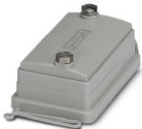
HEAVYCON ADVANCE, IP66, B6 protective cover for panel mounting side, with screw locking, with retaining cord, diameter of retaining cord eyelet: 3 mm

Please be informed that the data shown in this PDF Document is generated from our Online Catalog. Please find the complete data in the user's documentation. Our General Terms of Use for Downloads are valid ( http://phoenixcontact.com/download )