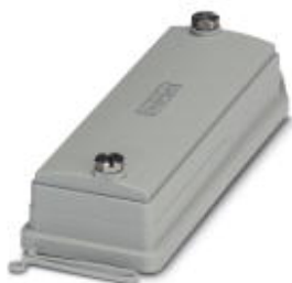
HEAVYCON ADVANCE, IP66, B24 protective cover for panel mounting side, with screw locking, with retaining cord, diameter of retaining cord eyelet: 3 mm

Please be informed that the data shown in this PDF Document is generated from our Online Catalog. Please find the complete data in the user's documentation. Our General Terms of Use for Downloads are valid ( http://phoenixcontact.com/download )