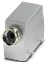
Sleeve housing, for double locking latch, height 65 mm, with screw connection, 1x Pg21, lateral cable entry

Please be informed that the data shown in this PDF Document is generated from our Online Catalog. Please find the complete data in the user's documentation. Our General Terms of Use for Downloads are valid ( http://phoenixcontact.com/download )