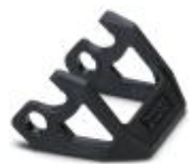
Replacement double locking latch for HEAVYCON EVO housing, HC-B10/HC-B16/HC-B24, PA

Double locking latch - HC-B10-24-DL-PLBK - 1407696