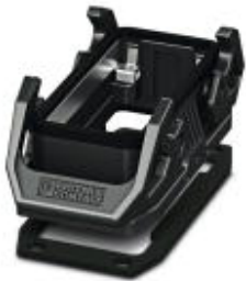
HEAVYCON EVO panel mounting base, plastic, B16, with double locking latch, height: 30.5 mm, with flat gasket

Please be informed that the data shown in this PDF Document is generated from our Online Catalog. Please find the complete data in the user's documentation. Our General Terms of Use for Downloads are valid ( http://phoenixcontact.com/download )