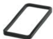
Profile gasket for HEAVYCON EVO supporting base element type B16

Profile gasket - HC-B16-SP-RBK - 1407708