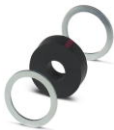
Notched seals/2 washers, for pressure screws, type Pg16

Please be informed that the data shown in this PDF Document is generated from our Online Catalog. Please find the complete data in the user's documentation. Our General Terms of Use for Downloads are valid ( http://phoenixcontact.com/download )