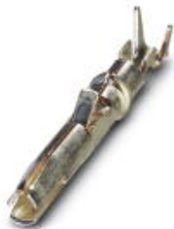
Rolled female contact, single contacts, silver-plated, 1.5 mm 2 ... 2.5 mm 2

Please be informed that the data shown in this PDF Document is generated from our Online Catalog. Please find the complete data in the user's documentation. Our General Terms of Use for Downloads are valid ( http://phoenixcontact.com/download )