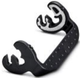
Replacement plastic single locking latch for standard housings of type B16

Please be informed that the data shown in this PDF Document is generated from our Online Catalog. Please find the complete data in the user's documentation. Our General Terms of Use for Downloads are valid ( http://phoenixcontact.com/download )