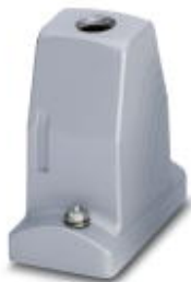
HEAVYCON ADVANCE EMV sleeve housing B10, with screw locking, height 100 mm, with 1xM32 thread, straight cable outlet

Please be informed that the data shown in this PDF Document is generated from our Online Catalog. Please find the complete data in the user's documentation. Our General Terms of Use for Downloads are valid ( http://phoenixcontact.com/download )