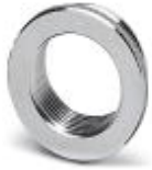
Reducing adapter, metal, M32 to M25, including O-ring

Reducing adapter - REDUC-M-KV-M32/M25 - 1647637