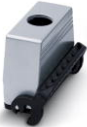
HEAVYCON coupling housing B24, with single locking latch, height 80 mm, with thread 1x M25

Please be informed that the data shown in this PDF Document is generated from our Online Catalog. Please find the complete data in the user's documentation. Our General Terms of Use for Downloads are valid ( http://phoenixcontact.com/download )