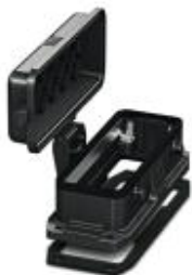
HEAVYCON EVO panel mounting base, plastic, B24, for double locking latch, height: 30.5 mm, with flat gasket, with protective cover

Please be informed that the data shown in this PDF Document is generated from our Online Catalog. Please find the complete data in the user's documentation. Our General Terms of Use for Downloads are valid ( http://phoenixcontact.com/download )