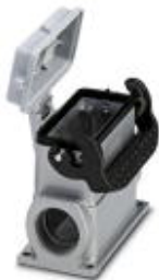
Box mounting base, with single locking latch, height: 74 mm, with gland, 1 x Pg21, with protective cover

Please be informed that the data shown in this PDF Document is generated from our Online Catalog. Please find the complete data in the user's documentation. Our General Terms of Use for Downloads are valid ( http://phoenixcontact.com/download )