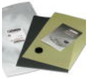
Polymer fiber polishing set, for F-SMA quick mounting connectors

Assembly tool - PSM-SET-FSMA-POLISH - 2799348