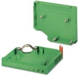
Cable housing, pitch: 0 mm, number of positions: 9, dimension a: 70.38 mm, color: green

Please be informed that the data shown in this PDF Document is generated from our Online Catalog. Please find the complete data in the user's documentation. Our General Terms of Use for Downloads are valid ( http://phoenixcontact.com/download )