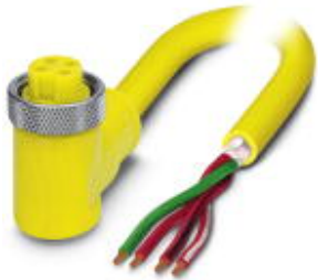
Sensor/Actuator cable, 4-position, PVC, Yellow RAL 1021, free cable end, on Socket angled 7/8"-16UNF, A-coded, Cable length: 6 m

Please be informed that the data shown in this PDF Document is generated from our Online Catalog. Please find the complete data in the user's documentation. Our General Terms of Use for Downloads are valid ( http://phoenixcontact.com/download )