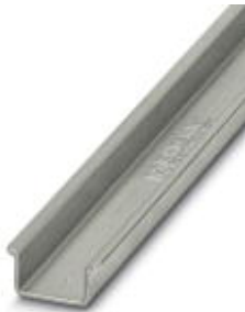
DIN rail, unperforated, Length: 1000 mm

Please be informed that the data shown in this PDF Document is generated from our Online Catalog. Please find the complete data in the user's documentation. Our General Terms of Use for Downloads are valid ( http://phoenixcontact.com/download )