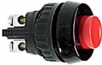
Pict.: Screw terminals, red