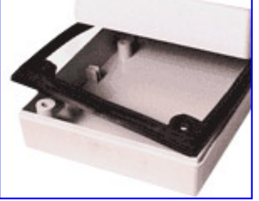
Perimeter Seal (P/N PS-15)