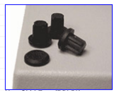
Non-Skid Feet (P/N 50) RETURN TO TOP