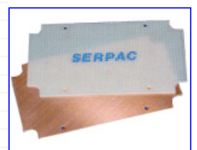
Grid and Clad Protoyping Boards Pocket Clip (P/N 350/331, 450/431)