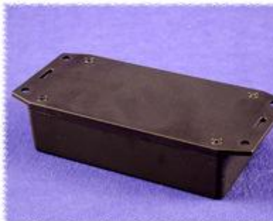
Assembled View (Bottom)