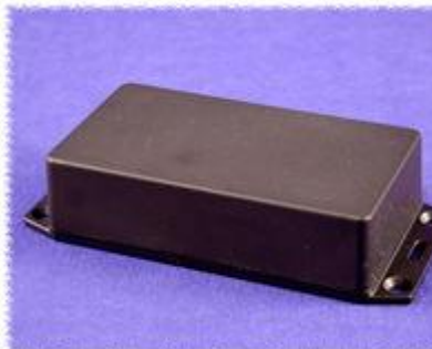
Assembled View (Top)