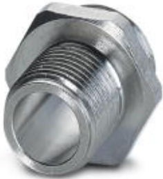
Housing screw connection, Plug, Link: M12, Front mounting, M14 x 1

Please be informed that the data shown in this PDF Document is generated from our Online Catalog. Please find the complete data in the user's documentation. Our General Terms of Use for Downloads are valid ( http://phoenixcontact.com/download )