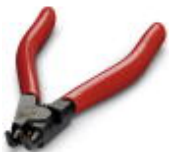
Contact removal tool for HC-M-EMV contact carriers

Contact removal tool - HC-M-EMV-KON-EWZ - 1678635