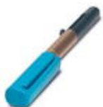
Contact removal tool, for turned and rolled CK- 1.6-... contacts

Contact removal tool - VC-EW 1,6 - 1884869