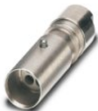
EMC contact carrier, 4-pos., shielded to connect shielded conductors from 3 - 6 mm conductor external diameter, male

Please be informed that the data shown in this PDF Document is generated from our Online Catalog. Please find the complete data in the user's documentation. Our General Terms of Use for Downloads are valid ( http://phoenixcontact.com/download )