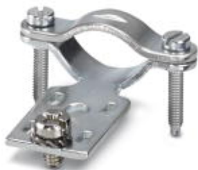
Strain relief clamps contact inserts of series: B-, BB-, D 40, D 64, DD and HV, straight cable exit

Please be informed that the data shown in this PDF Document is generated from our Online Catalog. Please find the complete data in the user's documentation. Our General Terms of Use for Downloads are valid ( http://phoenixcontact.com/download )