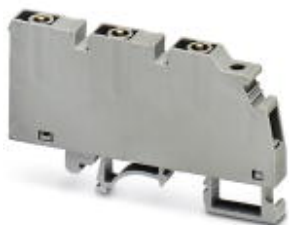
Flange, fitted on the left and right of UPCV3K 4-G-7,62, for a reliable screw connection with plugs with a screw flange

Please be informed that the data shown in this PDF Document is generated from our Online Catalog. Please find the complete data in the user's documentation. Our General Terms of Use for Downloads are valid ( http://phoenixcontact.com/download )