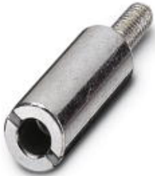
Locking screw barrel, for a firm connection of contact inserts and DIN-rail mountable terminal adapters

Please be informed that the data shown in this PDF Document is generated from our Online Catalog. Please find the complete data in the user's documentation. Our General Terms of Use for Downloads are valid ( http://phoenixcontact.com/download )