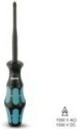
Screwdriver, crosshead PH (lasered), insulated, size: PH 2 x 100, 2-component handle, with non-slip grip

Please be informed that the data shown in this PDF Document is generated from our Online Catalog. Please find the complete data in the user's documentation. Our General Terms of Use for Downloads are valid ( http://download.phoenixcontact.com )