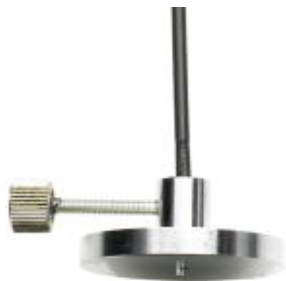
Polisher, made of metal, for CK1,6-...POF contacts, POF conductor diameter: 2.2 mm

Please be informed that the data shown in this PDF Document is generated from our Online Catalog. Please find the complete data in the user's documentation. Our General Terms of Use for Downloads are valid ( http://phoenixcontact.com/download )