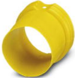
Opener for corrugated tube, to disassemble corrugated tube screw connection, size Pg29

Please be informed that the data shown in this PDF Document is generated from our Online Catalog. Please find the complete data in the user's documentation. Our General Terms of Use for Downloads are valid ( http://phoenixcontact.com/download )