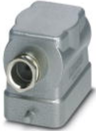
HEAVYCON B6 sleeve housing, for single locking latch, height: 56 mm, with 1 x M20 screw connection, lateral cable outlet

Please be informed that the data shown in this PDF Document is generated from our Online Catalog. Please find the complete data in the user's documentation. Our General Terms of Use for Downloads are valid ( http://phoenixcontact.com/download )